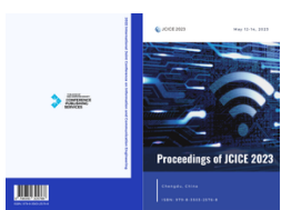
JCICE 2023 Chengdu, China Published by IEEE CPS ISBN: 979-8-3503-2576-8 Ei Compendex & Scopus