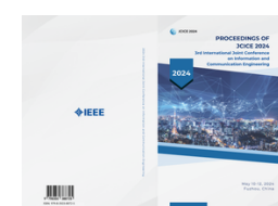
JCICE 2024 Fuzhou, China Published by IEEE CPS ISBN: 979-8-3503-8872-5 Ei Compendex & Scopus