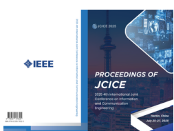
JCICE 2025 Harbin, China Published by IEEE ISBN: 979-8-3315-7632-5 Ei Compendex & Scopus