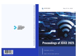
JCICE 2023 Chengdu, China Published by IEEE CPS ISBN: 979-8-3503-2576-8 Ei Compendex & Scopus