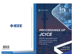
JCICE 2025 Harbin, China Published by IEEE ISBN: 979-8-3315-7632-5 Ei Compendex & Scopus