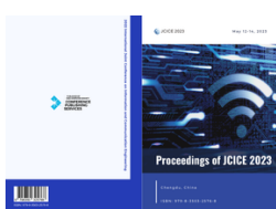
JCICE 2023 Chengdu, China Published by IEEE CPS ISBN: 979-8-3503-2576-8 EI Compendex & Scopus