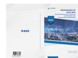
JCICE 2024 Fuzhou, China Published by IEEE CPS ISBN: 979-8-3503-8872-5 EI Compendex & Scopus