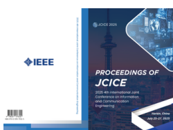
JCICE 2025 Harbin, China Published by IEEE ISBN: 979-8-3315-7632-5 EI Compendex & Scopus