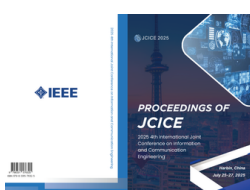
JCICE 2025 Harbin, China Published by IEEE ISBN: 979-8-3315-7632-5 Ei Compendex & Scopus