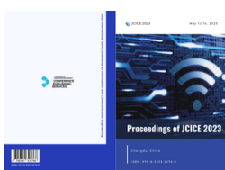
JCICE 2023 Chengdu, China Published by IEEE CPS ISBN: 979-8-3503-2576-8 Ei Compendex & Scopus