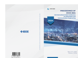
JCICE 2024 Fuzhou, China Published by IEEE CPS ISBN: 979-8-3503-8872-5 Ei Compendex & Scopus